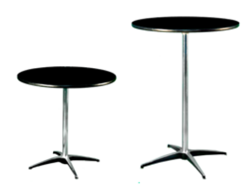
30" and 42" High Pedestal Tables

All pedestal tables come with a spandex cover in your choice of color. If you fail to specify a color, the show color will be given or, if show color isn't available, black will be given.